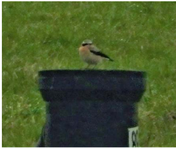
Wheatear – Geoff Emmett

Then a mega 13 th , an Avocet found on the bund at Tern scrape staying until late afternoon. The finders were a couple visiting from Moor Green. 21 st an early Whinchat LFL (FJC et al), 25 th another Curlew , 26 th another Whimbrel which amazingly stayed for 3 days, roosting on the shingle island. And then 28 th another mega, an adult Kittiwake on BSL (FJC et al), stayed for about 2 hours, was joined by another Little Gull , which stayed on most of the day. Then 30 th a male Garganey on Sandford (Jo Taylor et al) stayed 8 days, acting very territorial and chasing other species away from around the reed bed near the hide.