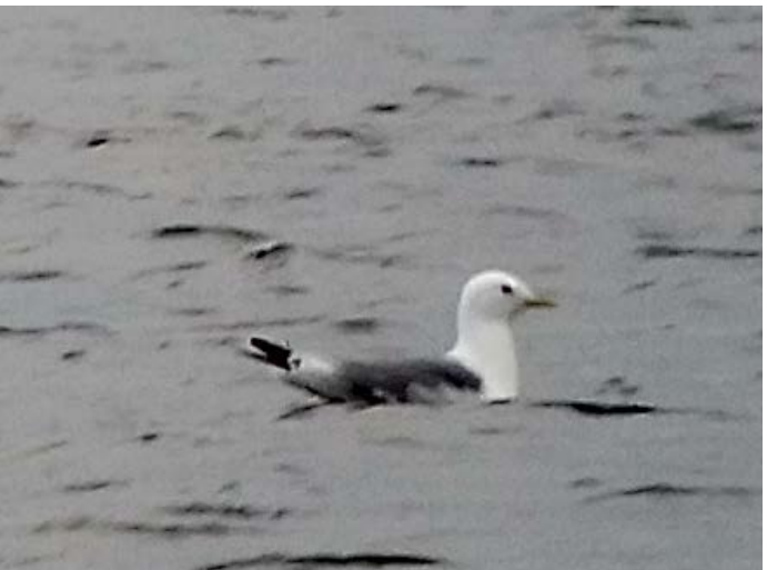
Kittiwake 28 th April – FJC