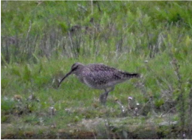
Whimbrel