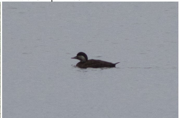
Common Scoter – Marek Walford

May – 1 st another mega - a Wood Warbler opposite Lavell's car park (FJC et al), singing it's heart out all day, moving to a large Oak overlooking the old gold course until 15:15. 8 th brought more excitement, a Black Tern LFL (JMcG & FJC), also seen briefly at BSL (BTB), 12 th another Whinchat LFL (RJS), 14 th Greenshank heard only