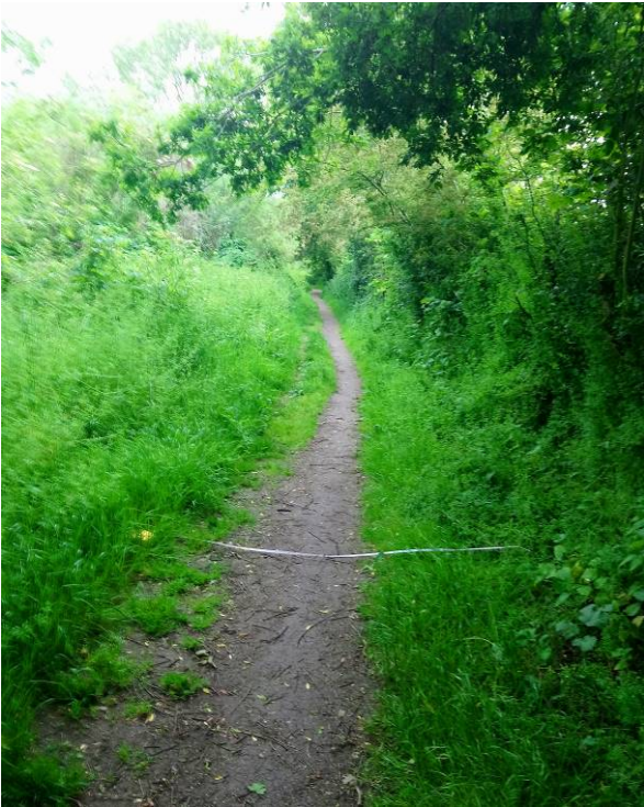
Loddon Footpath as is May 2019