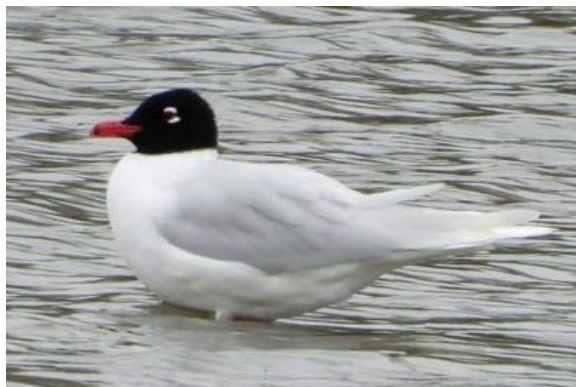
Med Gull – Geoff Emmett

April – All quiet until 5 th then a pair of Med Gulls , dropped in LFL staying 2 days, the 9 th will be remembered for quite a long time, with a major fall of migrants : 2 Wheatear, 2 male Yellow Wagtail, 3 White Wagtail, Scandinavian Rock Pipit, Curlew, Whimbrel and Sedge Warbler all on the same day. 11 th a Tree Pipit flew over low near Bittern Hide (FJC & JMcG), another Wheatear 12 th .