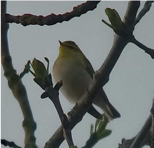
Wood Warbler 1 st May – FJC

Nightingale (LB et al), and numerous sightings of Hobby and late Common Sandpiper. The last surprise of the May has been Spotted Flycatcher 20 th , and same day a pair of White Stork flew over low South (Suren Akkaraju).