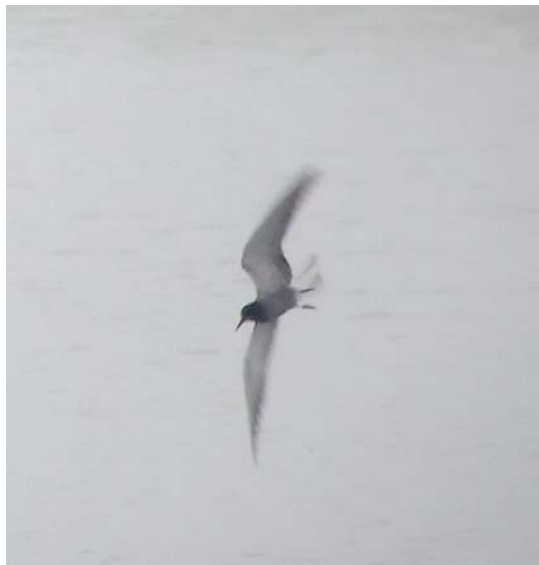
Black Tern 17 th May – FJC