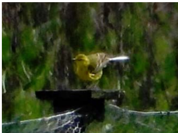
Yellow Wagtail – Geoff Emmett