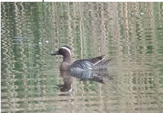
Garganey 30 th March