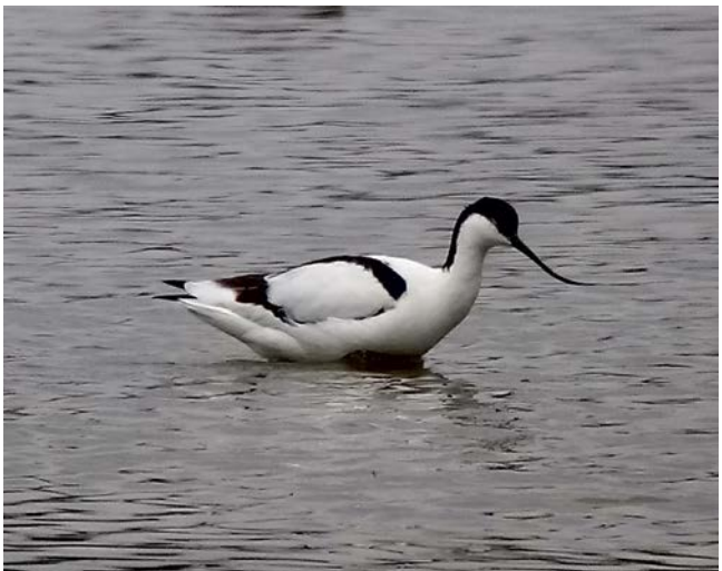
Avocet 13 th April – FJC

Then a mega 13 th , an Avocet found on the bund at Tern scrape staying until late afternoon. The finders were a couple visiting from Moor Green. 21 st an early Whinchat LFL (FJC et al), 25 th another Curlew , 26 th another Whimbrel which amazingly stayed for 3 days, roosting on the shingle island. And then 28 th another mega, an adult Kittiwake on BSL (FJC et al), stayed for about 2 hours, was joined by another Little Gull , which stayed on most of the day. Then 30 th a male Garganey on Sandford (Jo Taylor et al) stayed 8 days, acting very territorial and chasing other species away from around the reed bed near the hide.