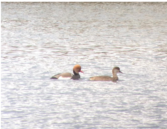
Red Crested Pochard pair (FJC)

February remained flooded and quiet until a pair of Red Crested Pochard showed up 18 th (FJC), 2 became 3/22 nd (SPD), staying thru March, then 4/30 th , 4/3 rd April , 4/27 th May (PSc), the last record was 2/5 th June (RNM). In that time the birds were spread between BSL, Sandford & LFGP, at one time a male seemed to try and become surrogate father to a family of Mallards.