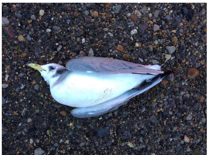
Kittiwake expired (FJC)

Also in February, Oystercatcher arrived 18 th (Rick Dawson), then Shelduck arrived with 3/19 th (BTB), Mediterranean Gull 21 st (PSc), a wintering Blackcap same day (TOA), Redshank next 1/25 th (PSc). March livened up further, Little Owl 1 st (MFW) in the large Oak next to Lea Farm buildings and was seen all spring. Mandarin 2/4 th LFGP (RNM), 2 Redshank 7 th , Raven over 7 th too, 2/8 th , 22 nd & 24 th , Chiffchaff arrived very early with 6/8 th all on Lavellø. Earlier arrival dates occurred in the 90ø, but it is unclear if they were singles and not wintering birds passing thru, these 6 singing birds leave little doubt that they were spring arrivals.