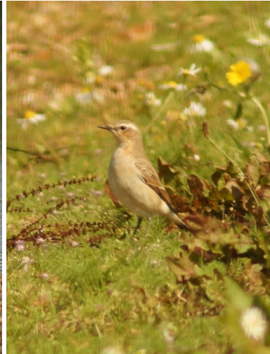
Wheatear (Alan Rymer)

August brought a nice early Osprey 7 th (FJC), heading North! A lovely flock of 21 Black-tailed Godwit 10 th on Tern Scrape (R Price, GP & BTB) stayed quite some time, sadly the news was not passed out in time for others to witness such a fine sight. A Dunlin tried to break long staying records, from 12 th to 19 th , passage of Grey Wagtail went on all month, Wheatear passage continued 16 th to 25 th , with 4/23 rd (GSE), perhaps a bizarre high count of 18 Mistle Thrush occurred on 19 th (BTB). Spotted Flycatcher passage began 22 nd (BTB), 3/24 th (TAG et al), a Spotted Redshank was heard over 26 th (FJC), Marsh Harrier early 27 th (MFW), then Curlew later (FJC), then Redstart 30 th (BTB, TAG et al) and 6 Yellow Wagtail later (FJC).