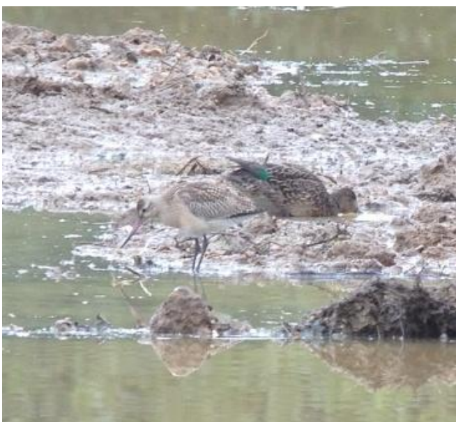
Bar-tailed Godwit (FJC)

September 1 st a Whinchat and Stonechat LFGP (BTB), 3 Green & 3 Common Sandpiper 2 nd , Hobby appeared too, at least 3 between 2 nd to 18 th , over Lavellø to the landfill airspace, 2 nd a Wheatear (PSc, FJC & ARy) and a Tree Pipit over late afternoon (FJC), 3 rd A Swift, 6 th another Wheatear (GSE), and Whinchat (FJC) and another Curlew, this time landing on the landfill (GSE), 7 th a Bar-tailed Godwit came to check out the new diggings at LFGP's SW corner (FJC), staying overnight. 2 Redstart 8 th (RNM & LS) and more Yellow Wagtail passage occurred 4 th , 5 th , 7 th & 12 th , also 12 th another Whinchat (FJC).