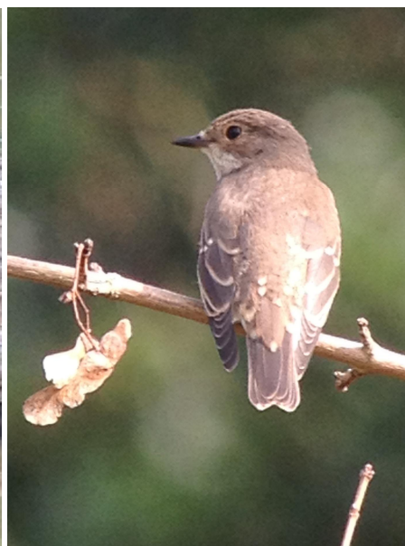
Spotted Flycatcher (FJC)