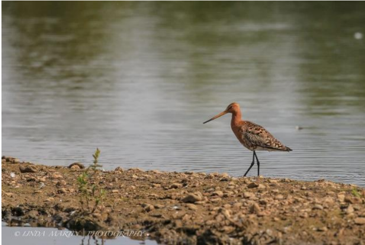
Black-tailed Godwit (Linda Martin)

One intriguing record is Water Rail 31 st July (BTB) and an earlier report of young near the feeding area, it begs the question if they did really breed and how we managed to miss them. Passage began 2 nd July with an Icelandic Black-tailed Godwit on Tern scrape (LM), 4 th Green Sandpiper and an early Wheatear (GSE & TAG), Common Sandpiper 7 th , another Black-tailed Godwit 23 rd LFGP (FJC) and 3 more Green Sandpiper 31 st (BTB).