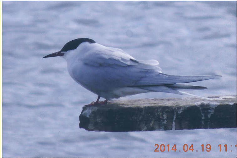
Arctic Tern (GSE)

June and Oystercatcher appeared with 1 young on Sandford, another pair may have attempted breeding on BSL main island, Little-ringed Plover were seen on and off, but again no evidence of breeding. Common Terns like in 2013 attempted breeding on Sandford, Lavellø and LFGP, summer rain wiped out most of them, but a few pairs bred successfully on LFGP, rearing 4+ young late in the summer.