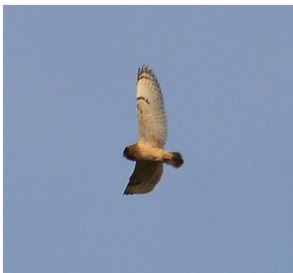
Short eared Owl

Late on in the month Stonechat count peaked at 3/23 rd & 24 th , 1 Wheatear on 25 th (GSE) was a late bird, and the first Goldeneye same day (SPD), on 27 th over 300 Golden Plover were circling way North (FJC), c35 doing the same 1 st & 2 nd November (FJC). November was seemed quiet, winter thrushes were late in, hardly any Siskin, the last records of Stonechat 1 st & 5 th and some Great Black Backed Gull passage South, 12/4 th , 18/5 th , but then another fantastic bird on the bird walk, a Short-eared Owl over in the bright sunlight 9 th , the Little Owl showed in the same Oak tree 14 th . Snipe numbers at Tern scrape were up to 20+ (RNM), then 25 th the first Woodcock of the year flew over at dusk (FJC).