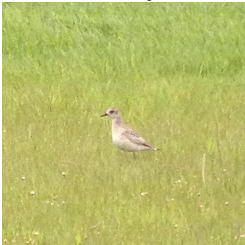
Grey Plover (FJC)

May brought Little Owl and 2 Raven 4 th (MFW), 3 Common Sandpiper 6 th , 3 Dunlin (ARy) and another Arctic Tern 8 th (MFW), Green Sandpiper 9 th (ARy), Grey Plover LFGP 10 th (BTB et al), 2 Wigeon re-appeared and stayed the whole summer, as did 2 Shoveler, but they did not breed. Hobby was very hard to find this year and remained so until late August.