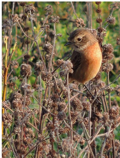
Stonechat (Richard Marsh)

Into October and a Black Tern thru at LFGP (FJC), seen after at Sandford & BSL (RNM, SPD & BTB), same day was the last Mandarin sighting 3 rd (MFW), also 71 Shoveler that day, Stonechat count rose to 2/6 th , 3 Ruff flew in at LFGP 8 th (TAG & GSE), but left quickly SE, 1 more landed briefly 10 th (GSE), 1 Dunlin 12 th , and light passage of Linnet SE on and off all month. The Garganey reappeared 14 th & 15 th at Tern Scrape (SPD et al), then the year's best bird also showed up on 15 th in the form of an Alpine Swift over the landfill heading SW at 13:42 (FJC & TAG), sadly only around for 3 minutes and the 9 th for Berkshire.