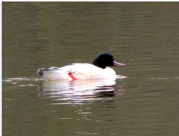
Goosander