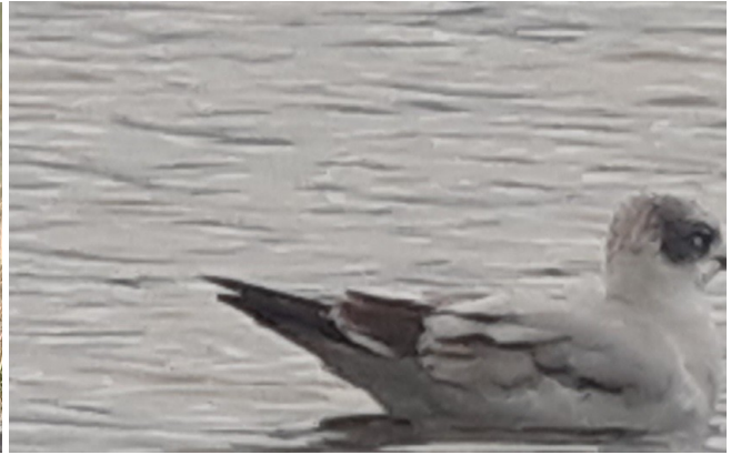
1 st winter Mediterranean Gull

On 22 nd our first Caspian Gull since 2017, Brambling were about but tough to connect with from 25 th , Linnet showed up on a few dates. February – Oystercatcher arrived 11 th , Jack Snipe from 4 th , but always elusive, Great Black-backed Gull 19 th and now a very uncommon fly over species now. 25 th Firecrest showed up in Jack's garden.