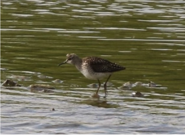
Wood Sandpiper – Jim McNulty