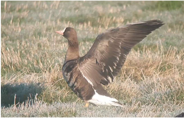
1 of 18 White-fronted Geese