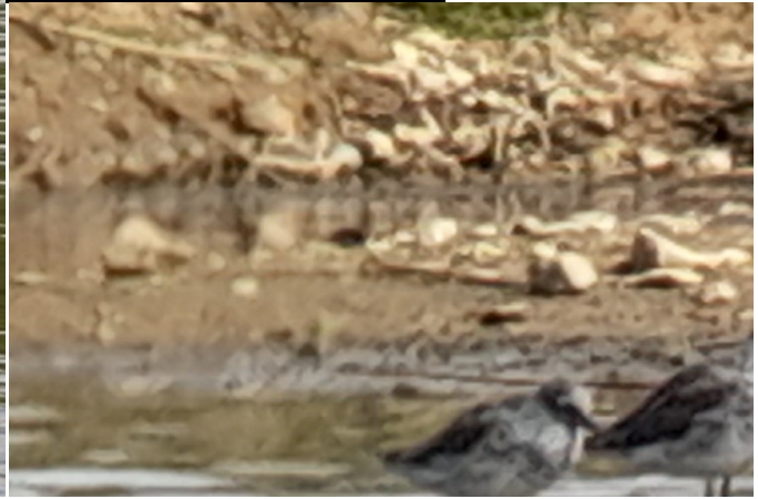
2 Greenshank - FJC