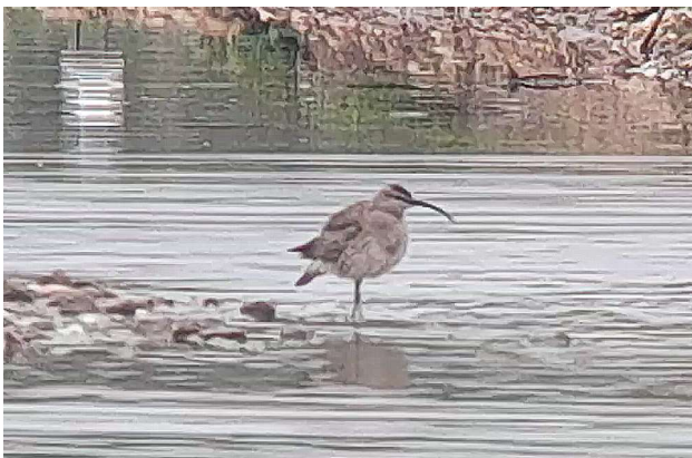
Whimbrel – FJC

May – 1 st a Yellow-legged Gull which probably had mixed blood, 2 Dunlin 2 nd briefly and a Whimbrel which as often happens only stayed for 4 minutes. Common Terns were up to 11/4 th , 3 Hobby 6 th , another Greenshank 7 th , a rare Wood Sandpiper 8 th and yet again this rare spring passage wader stayed barely 16 minutes. Another Dunlin 10 th , 2/11 th , 28 Common Terns 12 th , 2 Ringed Plover 15 th , an amazingly late Scaup 16 th on Lavell's, another Ringed Plover 22 nd